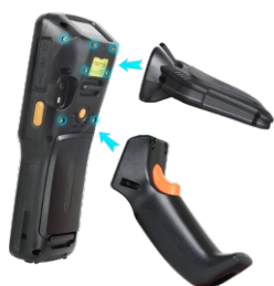
UHF Module & Gun Grip