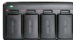
Quad-Slot Battery Charger